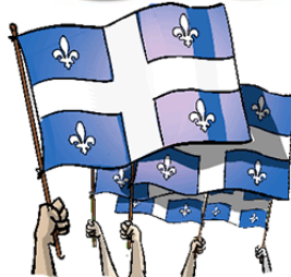
St. Jean Baptiste

is held annually on June 24, is the feast day of St John the Baptist, a Jewish preacher who baptized Jesus in the River Jordan. It is a day of celebration in Quebec and other areas of French Canada. The Nativity of St. John the Baptist - his feast day - is celebrated on June 24th. Hosting a bonfire or having a campfire with your family is a simple and wonderful way to celebrate this special saint this summer!